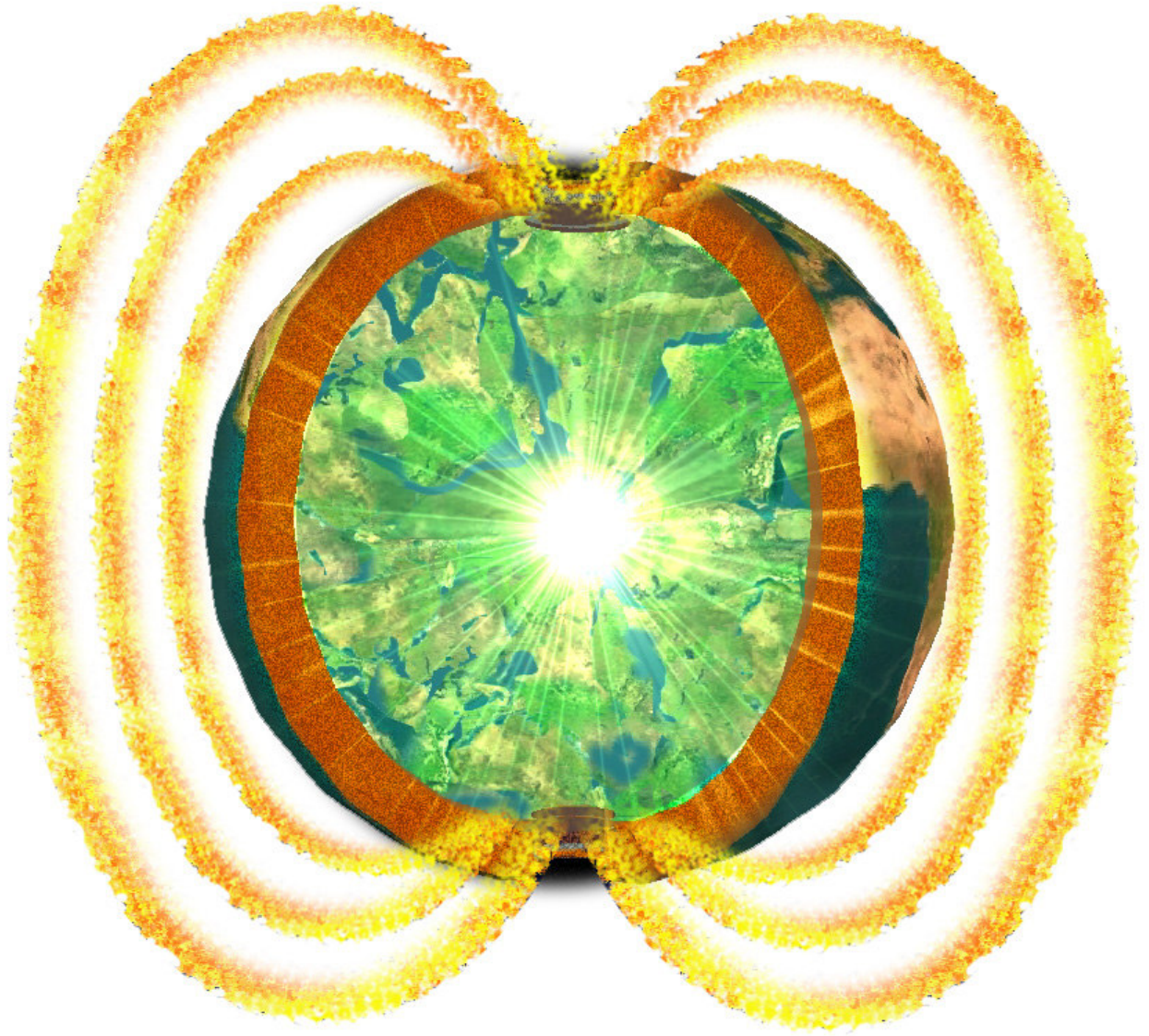
Illustration courtesy of One Light http://onelight.com This can also explain the theory of the round circular openings at the north and south poles. These openings are doorways to the inner earth.